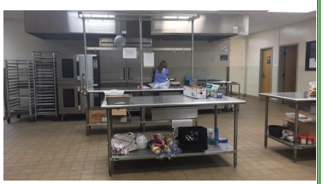
Large, fully equipped kitchen