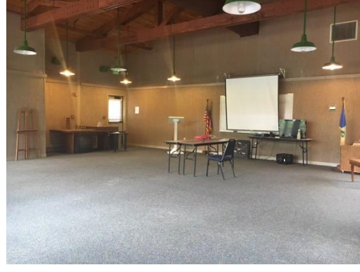
Meeting room – Capacity 60