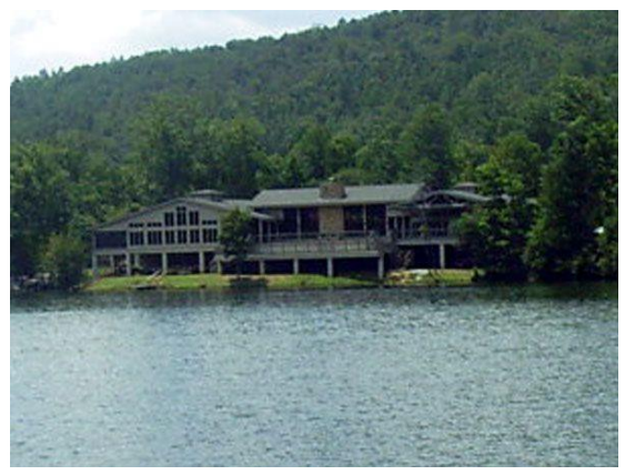
View from the lake