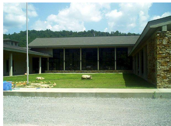
Entrance from the parking lot