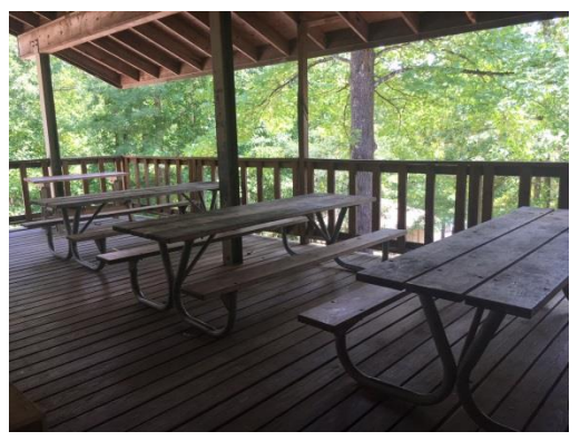
Outside deck area