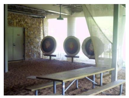
Sheltered Archery Range