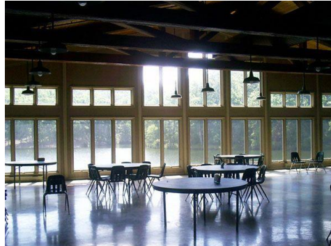
Dining Area- Capacity 165