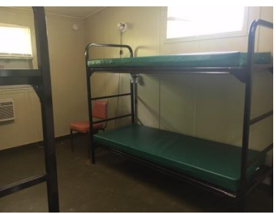
Each cabin sleeps up to 4