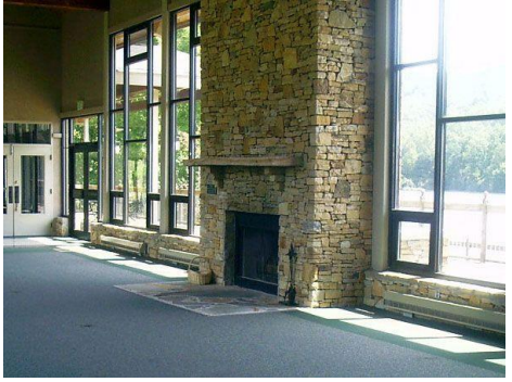
Gathering or reception area