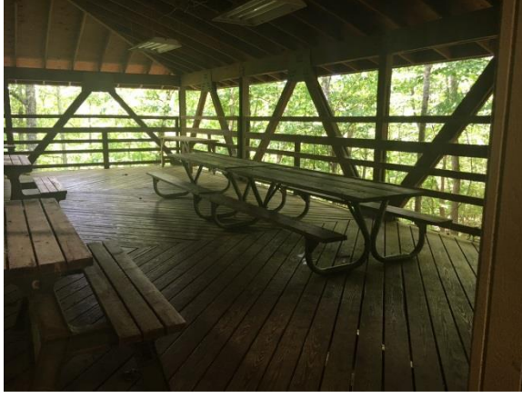
Deck attached to main building.