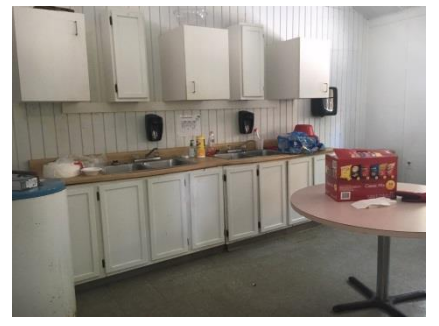
Kitchen has refrigerator, stove, and microwave