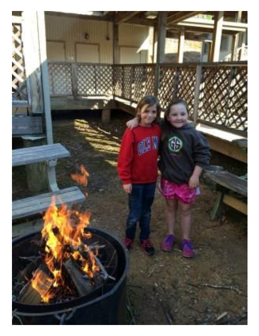
There is a fire pit with the unit.