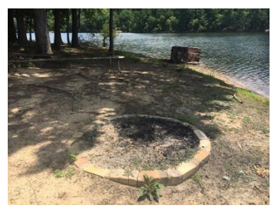
Fire Circle on Seminole Island