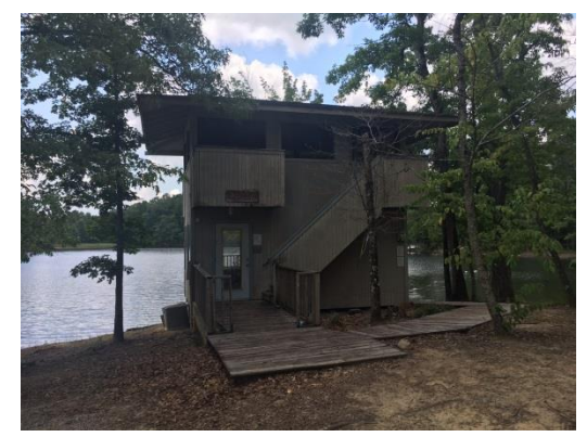
Nature Hut adjacent to Conference Center