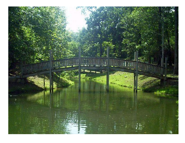
Bridge to Seminole Island, just steps from Osonnee Shelter.

The Osonnee shelter has two fire pits, a grill, refrigerator, ice machine, microwave and sinks. It is both heated and cooled year-round. The shelter is located adjacent to the ball field area and pool.