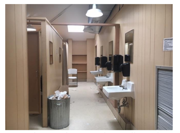
Bathroom has 3 sinks, stalls and showers